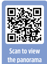
Scan to view the panorama

This area of upland pasture and forestry, stretching south-west of Edinburgh, supports diverse wildlife habitats: mosses and lichens, insects and mammals. These rolling, heather clad hills with reddish tops are a popular excursion for walkers. Scald Law is the highest peak in the Pentlands at 579m.